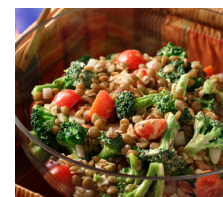
Broccoli Lentil Salad with Tumeric Yogurt Dressing