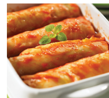
Bean-Stuffed Cabbage Rolls